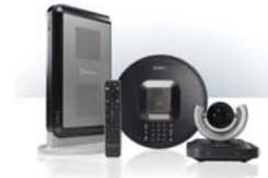
LifeSize® Room™ Series Premium HD communications