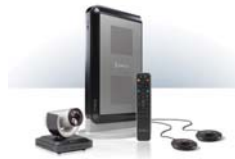
LifeSize® Team™ Series Ideal for distributed workgroups