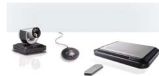
LifeSize® Express™ Series HD priced for any organization